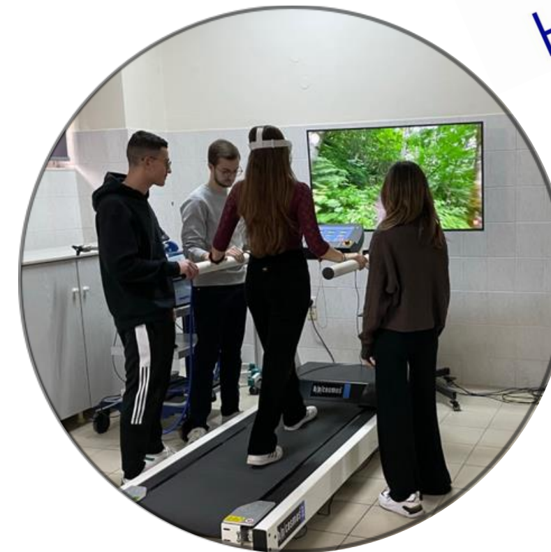
Clinical Exercise Physiology & Rehabilitation Lab